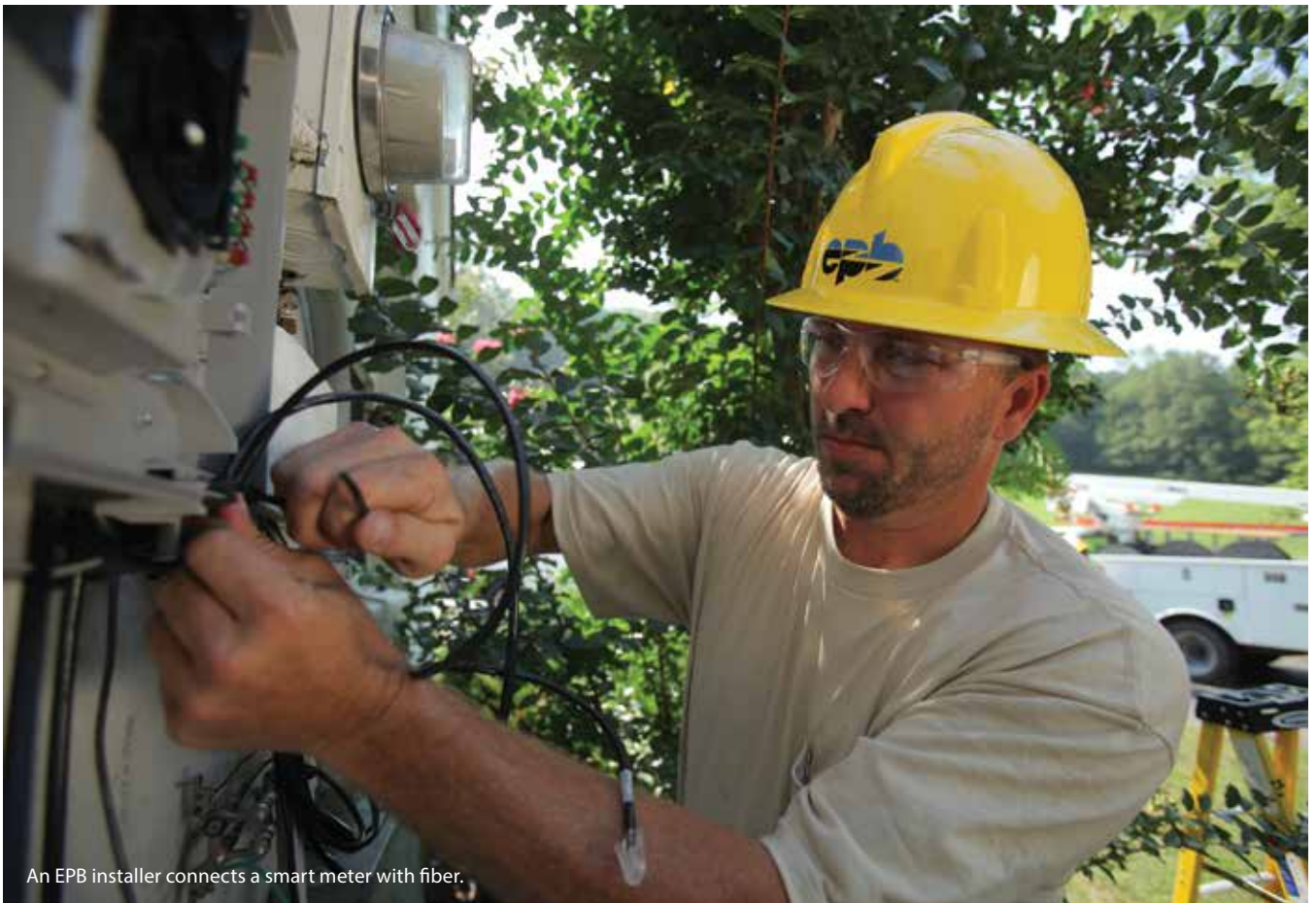
An EPB installer connects a smart meter with fiber.

gas interval data. They analyze and distribute this data to various utility departments through integrated software such as billing, customer management, outage management and GIS. The depth and quality of this analysis is a function of the accuracy and timeliness of consumption data as well as the power of the data analytics engine behind each application.